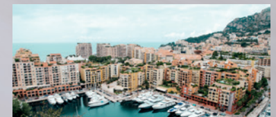
Private security – Paparazzi